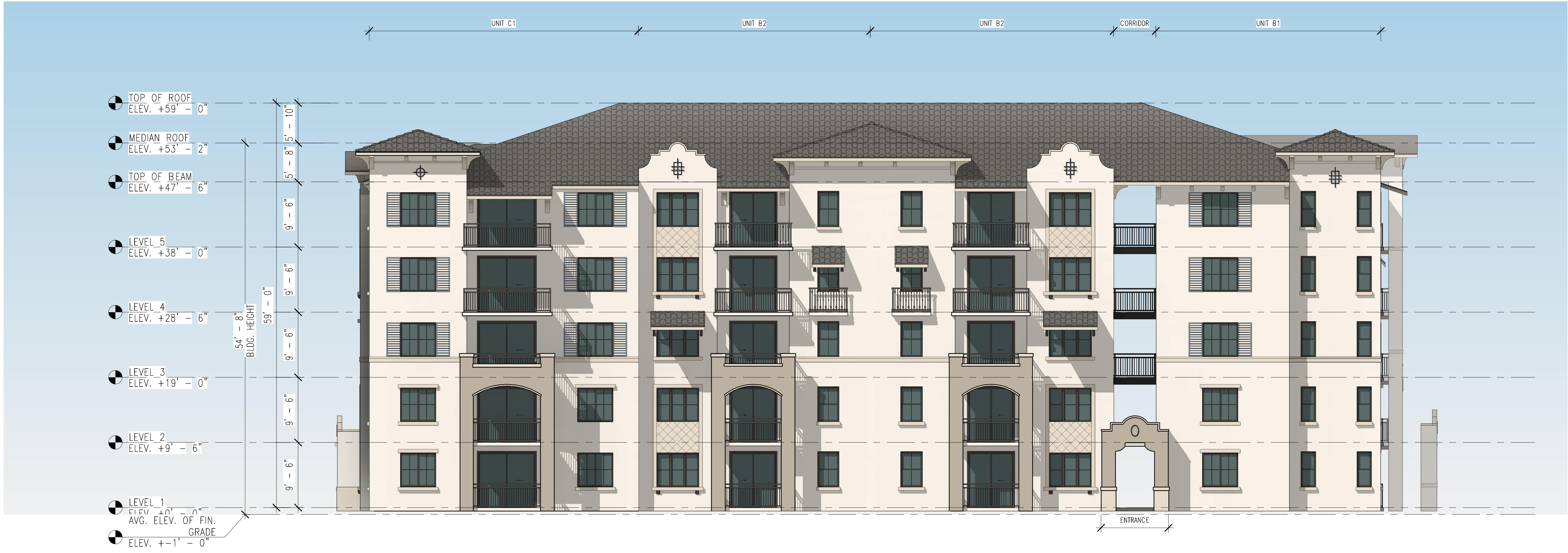
1 FRONT ELEVATION 1/8" = 1'-0"