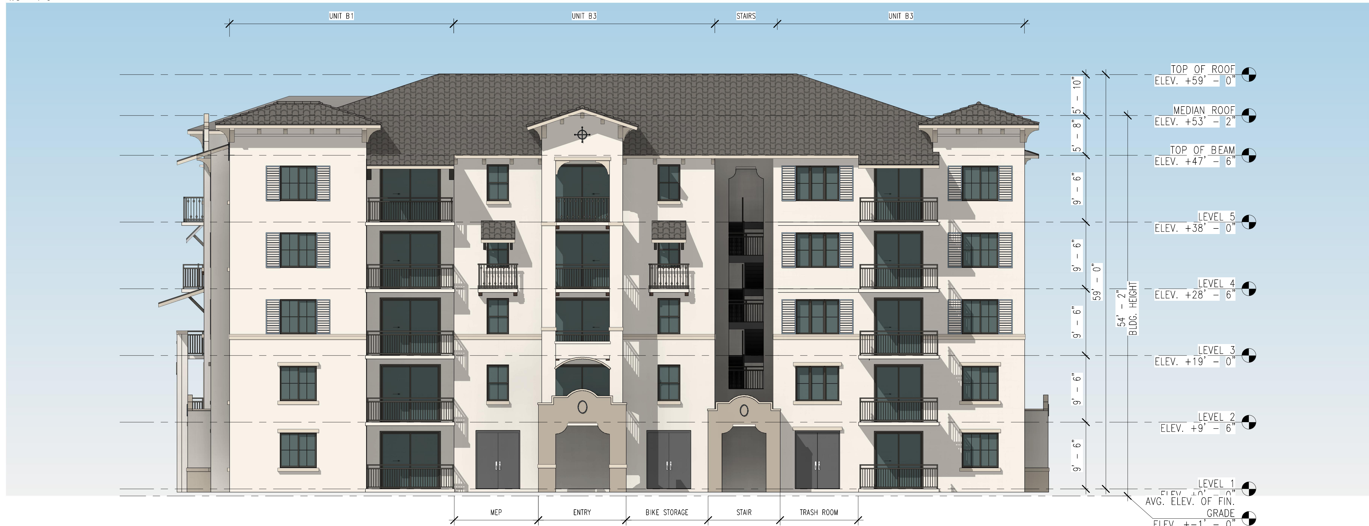
2 SIDE ELEVATION 1/8" = 1'-0"